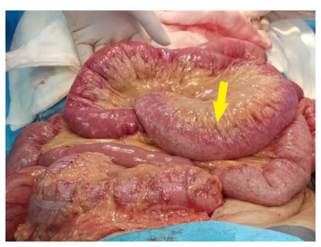
Figure 2. Air bubbles in the wall of the small intestine.

At the time of admission to the hospital, the patient's arterial blood pressure was 132/86 mmHg, oxygen saturation on room air was 90%, pulse rate was 98 beats/min, and body temperature was 37.6°C. In the abdominal examination of the patient, there was widespread tenderness and defense in all abdominal quadrants, but there was no rebound. Other system examinations were normal. There was normal stool contamination on rectal touch. Laboratory examination revealed leukocytosis (white blood cell count=13200 \mu l/ml), elevated C-reactive protein (51 mg/L), aspartate aminotransferase elevation (78 IU/L), and alanine aminotransferase elevation (63 IU/L). Other parameters were unremarkable.