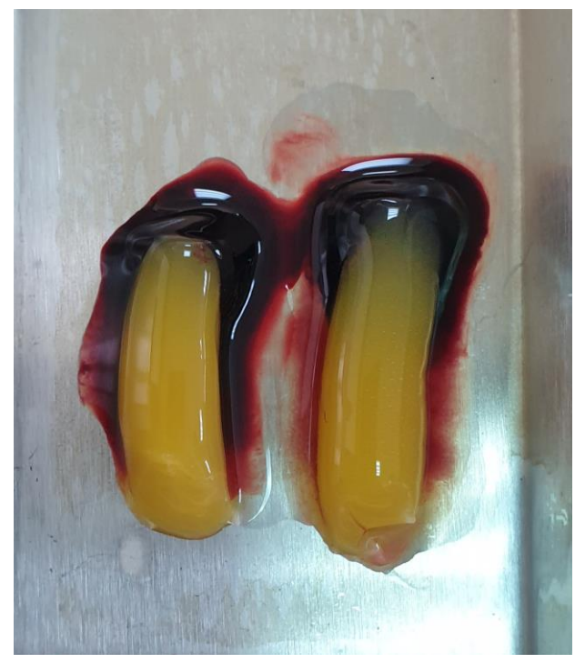
Fig. 5. Concentrated Growth Factor (CGF) after centrifugation. It is thicker, denser and darker in color than classic PRF

Platelet rich fibrin (PRF) is a second-generation platelet concentrate as it is a natural concentrate prepared with whole blood taken from a patient without adding any anticoagulants (14). PRF was firstly developed in France by Joseph Choukroun and colleagues in 2001 (15) with the aim of