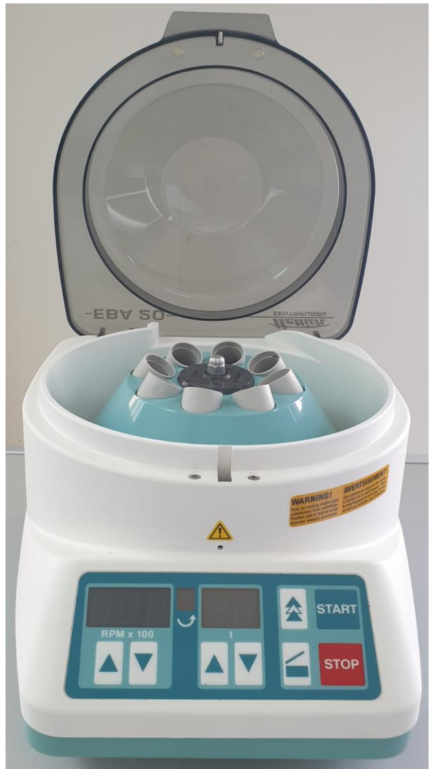
Fig. 2. Centrifugation machine used to centrifuge and produce any types of platelet concentrates