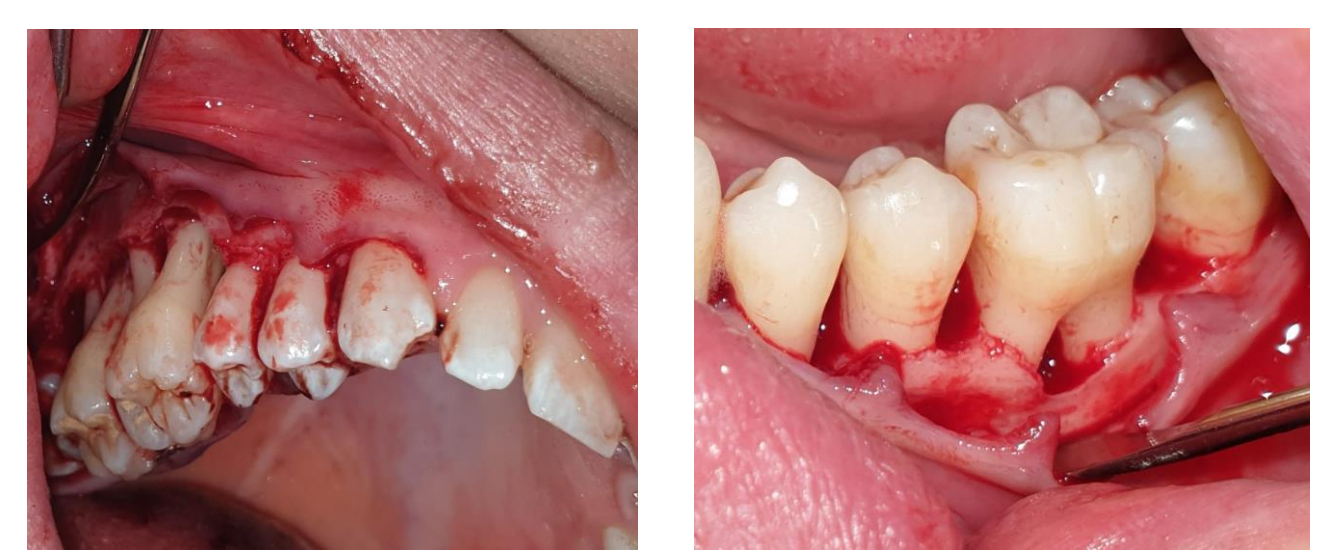
Fig. 1. Open flap debridement after granulation tissue removing shows periodontal defect, affected teeth and raised flap. (a) Maxilla. (b) Mandible