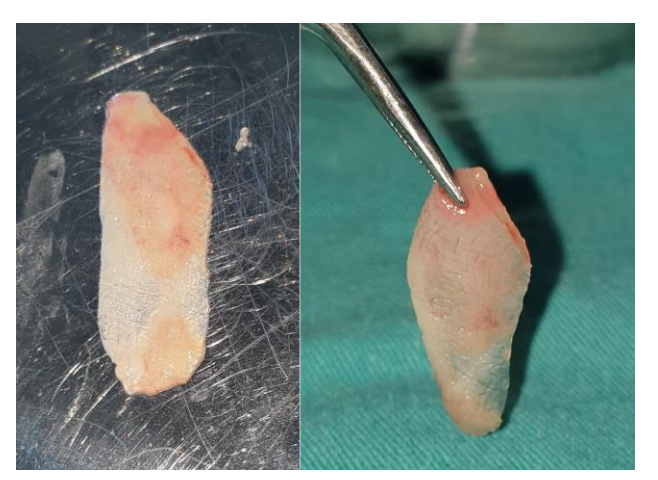
Fig. 6. PRF membrane obtained by PRF compressing. It is ready to use in covering bone graft as barrier membrane in implant and periodontal surgery

activation of growth factors, they stimulate a mitogenic activity of periosteum cells to accelerate bone healing (21). Cytokines (trombospondin-1, fibronectin, vitronectin, osteocalcin, osteonectin) are also released from the platelets, responsible in modulating platelet activation, proliferation and differentiation of leukocytes (22).