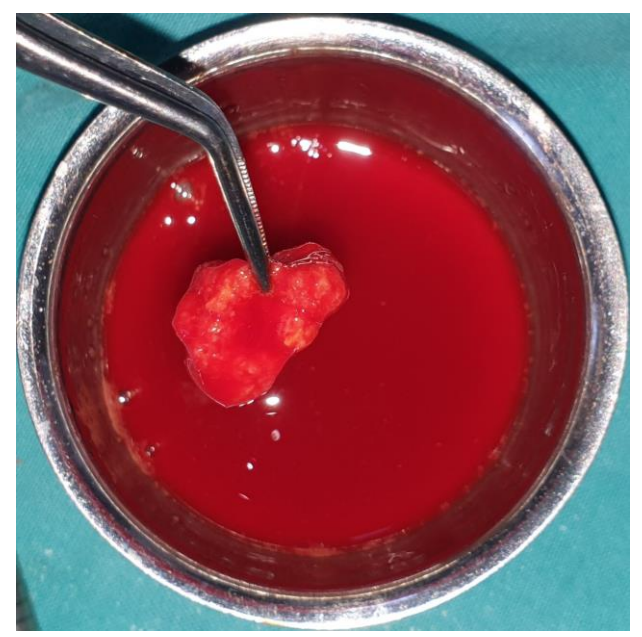
Fig. 4. Sticky bone (MPM) which prepared by mixing i-PRF and bone graft. It is ready to administration into periodontal defect

factors which have tissue regeneration capability. Therefore, this review article will clarify autologous platelet concentrates forms, preparation protocols, their growth factors efficiency, clinical applications, and will show the differences between them.