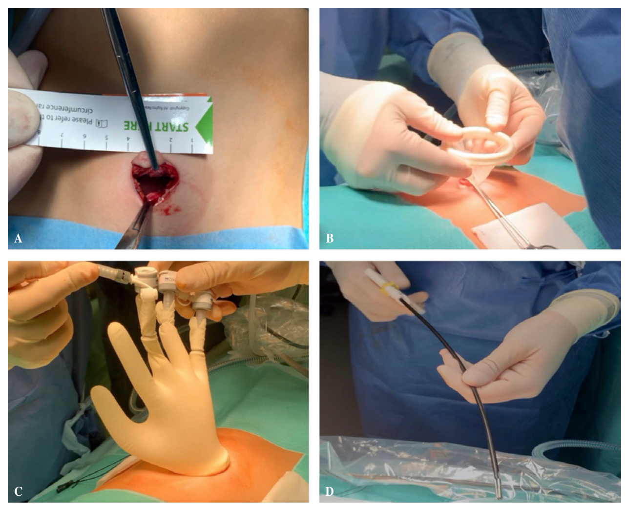
Figure 1. Incision at the lower umbilical fold (A) and placement of the surgical retractor (B) to couple the sterile glove (C). The conventional laparoscopic instruments are curved as required (D).