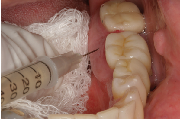
Fig. 2: Treatment with 0.1 mL of the 2.5% monoethanolamine oleate of gingival.