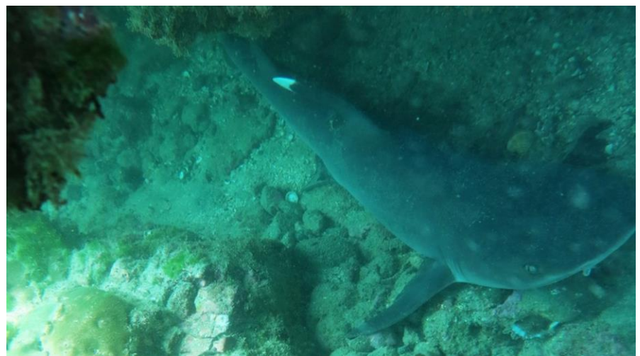
Figure 2. Whitetip reef shark in a rocky reef at El Barrote, BCS, Mexico.