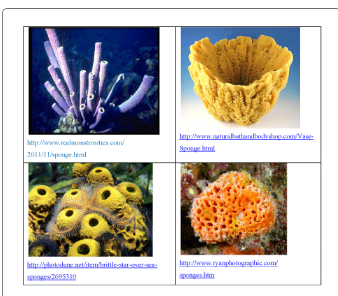
Figure 1: Photos of various sponges. Sponges are animals of the phylum Porifera (meaning "pore bearer"). They are multicellular, heterotrophic, lack cell walls, produce sperm cells and are hermaphroditic.

sessile organisms like sponges [11-13] (Figure 1).