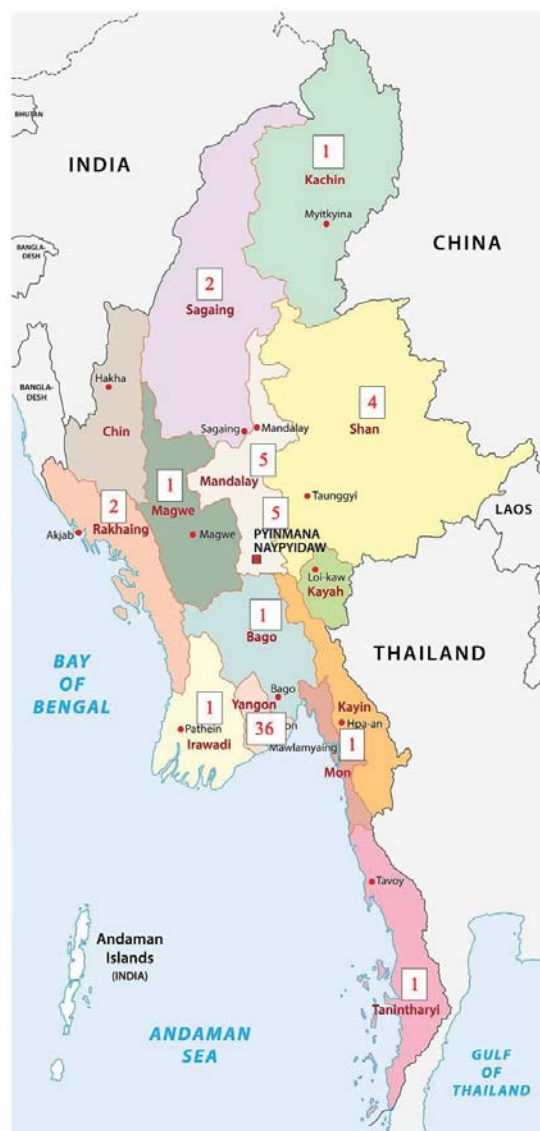
Figure 2 Distribution of physicians having fully vaccinated breakthrough infection according to their assigned states and divisions.

There are 14 States and Divisions in Myanmar. Seven States occupy hilly regions where they are less populated: Shan State, Kachin State, Chin State, Rachine State, Kayah State, Kayin State and Mon State. Seven Divisions are non-hilly areas; thus, they are densely populated favoring spread of epidemics: Yangon Division, Nay Pyi Daw Division, Mandalay Division, Sagaing Division, Bago Division,