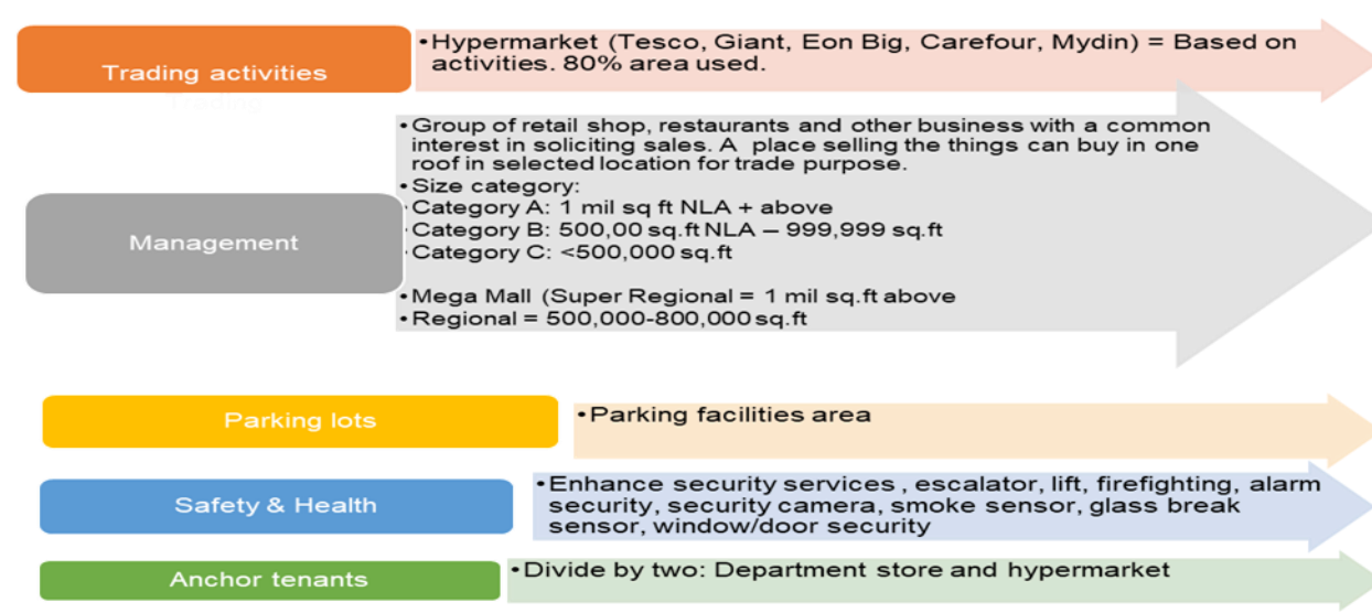
Fig.1 shows the differentiation definition shopping centre by practitioners in government and private sector