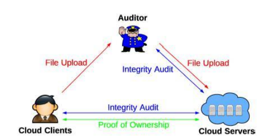
Fig. 1. SecCloud Architecture

A few instruction musings to be able to form the establishments of our approach.Linear Map and Computational Assumption Convergent Encryption The SecCloud framework assisting document level deduplication unites the going with 3 suggests independently protected with the aid of red, inexperienced and blue in Fig. 1.