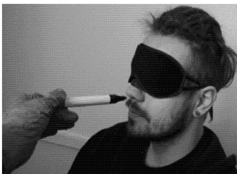
Figure 1. Sniffin' Sticks methods in progress