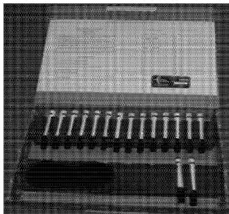
Figure 2. Odor Sensitivity Test Kit

Tests using an olfactometer were performed in accordance with the procedure contained in the standard (Polish Standardization Committee 2007). For dilution, n-butanol at a concentration of 59.8 ppm was used. The tests were performed at time intervals of not less than 4 days.