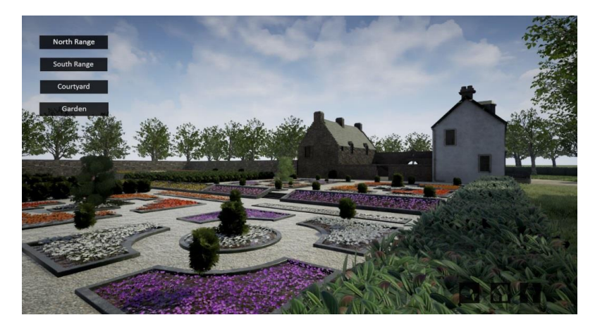
Fig. 1. A simple HIM prototype for Provan Hall

Different modes of interaction are supported in the prototype – with users able to examine and navigate through scenes through point-and-click, allowing users to quickly position and control a 'flying' camera, or first-person game style navigation, allowing users to virtually 'walk' around the scene, Fig. 1.