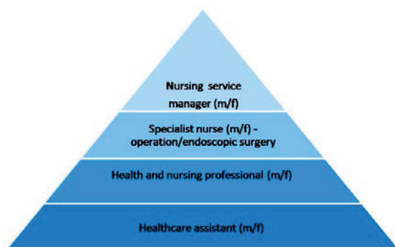
Fig. 1. The nursing professions at the qualification levels of occupations

According to the definition used in Classification of Occupations of 2010, professions are classified according to the level of requirements or the complexity of their activities. A distinction is made between four requirement levels and complexity levels. Thus, the professions of nursing personnel at the qualification levels of occupations are divided into the following groups: 1st qualification level – level of helpers and trainees (e.g., healthcare assistant), 2nd qualification level – level of skilled workers (e.g., health and nursing professional), 3rd qualification level – level of specialists (e.g., Specialist nurse (m/f) – operation/endoscopic surgery), 4th qualification level – level of experts (e.g., Nursing service manager) (Figure 1) (Bundesagentur für Arbeit, 2010; 2017).