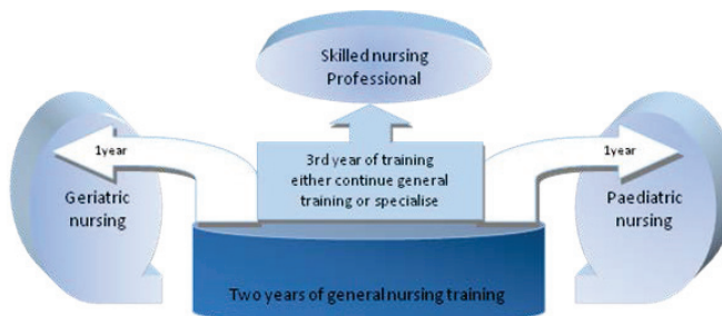
Fig. 5. General nursing training after 1 January 2020

All applicants starting to train as skilled nursing professionals after 1 January 2020 will undergo two years of general nursing training. In the third year of training, apprentices will either continue general training to become general nurses – skilled nursing professionals (Pflegefachfrau/Pflegefachmann) or specialise to become a geriatric nurse or a paediatric nurse. Besides, they can choose the training option that exactly fits their needs. Another plus of this general nursing training is that it is recognised across the EU or the European Economic Area, giving individuals working in nursing even more job opportunities. The new nursing training programme will be completely free of charge, and apprentices will receive adequate remuneration. Nursing professionals will have better opportunities for finding work, changing jobs, being promoted and for personal development in all areas of nursing care (BMFSFJ, 2018; DBfK, 2018; Make it in Germany, 2018) (Fig. 5).