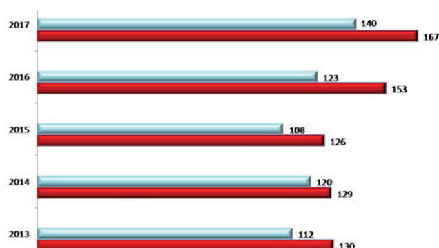
Fig. 2. Average job vacancy duration at the level of skilled workers and specialists: