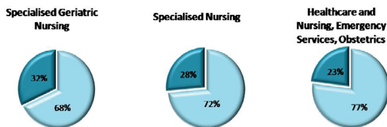
Fig. 4. ■ Shortage of specialists

Creating a new general nursing profession from the existing three independent nursing professions in geriatric nursing, healthcare and nursing, healthcare and paediatric nursing met with considerable resistance, especially in the care of the elderly. Later the coalition parties have agreed in the spring of 2017 on a political compromise on the reform of the nursing profession. Despite some criticism, the German Bundestag, with the consent of the Federal Council of Germany (Bundesrat), finally adopted on 17 July 2017 the new German Nursing Professions Act (Pflegerberufegesetz, PflBG) (Bündnis für Altenpflege, 2017; DBfK, 2018).