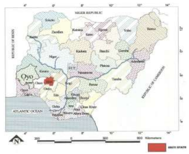
Fig.1: Map of Nigeria showing Ekiti State [8]

Ado Ekiti is a city in southwest Nigeria (Figure 1 & 2), the state capital and headquarters of the Ekiti. It is also known as Ado. It has a population of 308,621[7]. The projected population of Ado Ekiti in 2012 as put at 424, 340 by Wikipedia. The people of Ado Ekiti are mainly of the Ekiti sub-ethnic group of the Yoruba. Ado Ekiti (Figure 3) has three tertiary educational institutions namely: Ekiti State University, Afe Babalola University and The Federal Polytechnic Ado Ekiti. It also play host to two local television and radio stations; NTA Ado Ekiti, Ekiti State Television (BSES), Radio Ekiti and Progress FM Ado Ekiti. Various commercial enterprises operate in Ado Ekiti.