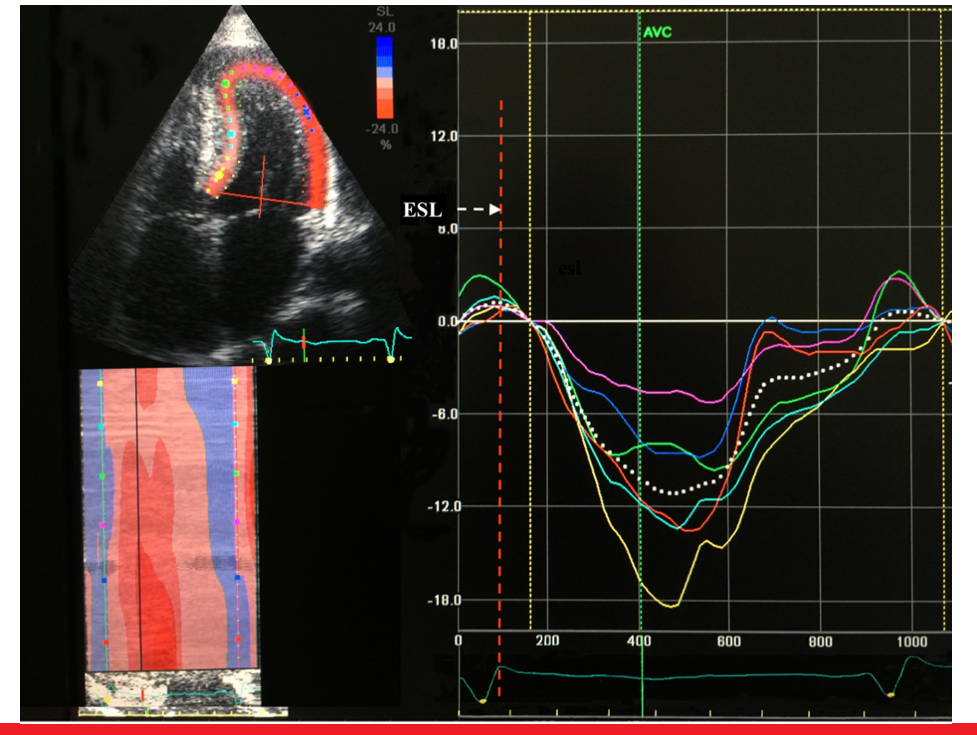
Figure 2. Echocardiographic image of early systolic lengthening measurement. AVC, atrioventricular canal; ESL, early systolic lengthening.

The chi-square test was used for between-group comparison of categorical variables and expressed as numbers (n) and percentages (%). Continuous variables were compared with 2 sample t -test and the Mann–Whitney U -test, the test selected according to distribution of variables. Continuous