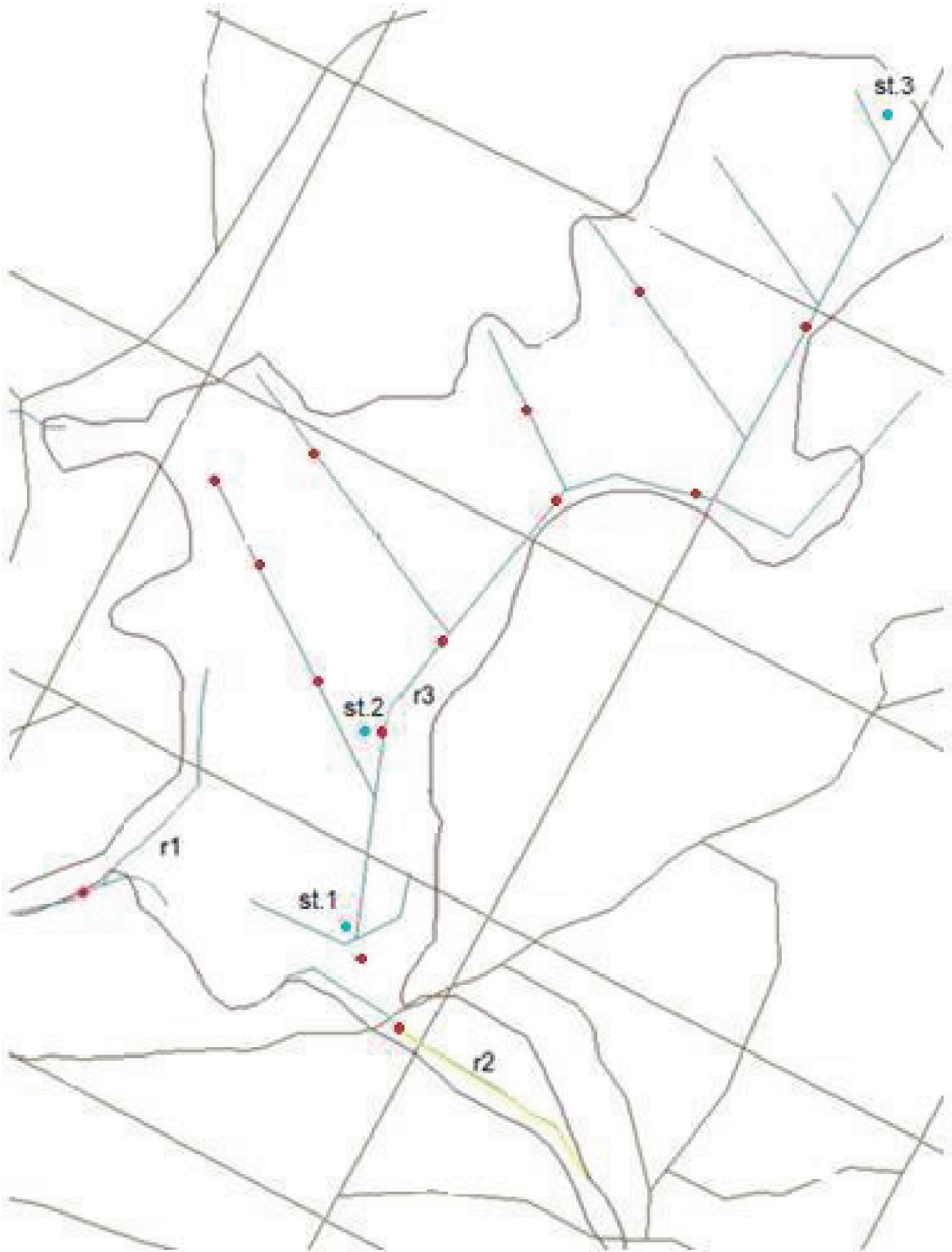
Figure 1. The location of measurement wells (●), and retention objects on the facilities (●).

and multiannual periods. That is why an analysis of impacts of functioning of constructed retention facilities should include meteorological conditions.