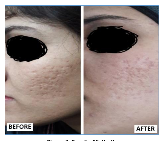
Figure 3. Result of Salicylic Acid Peeling