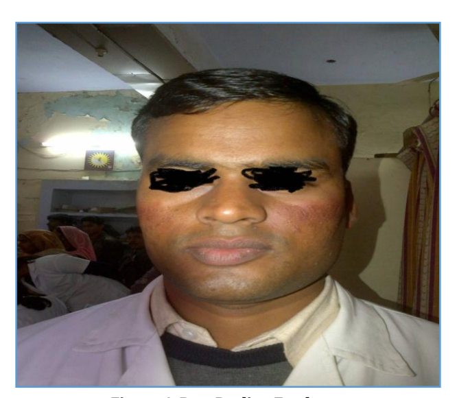
Figure 4. Post Peeling Erythema