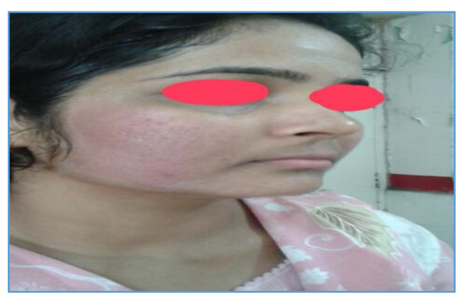
Figure 2. Complication of Microneedling