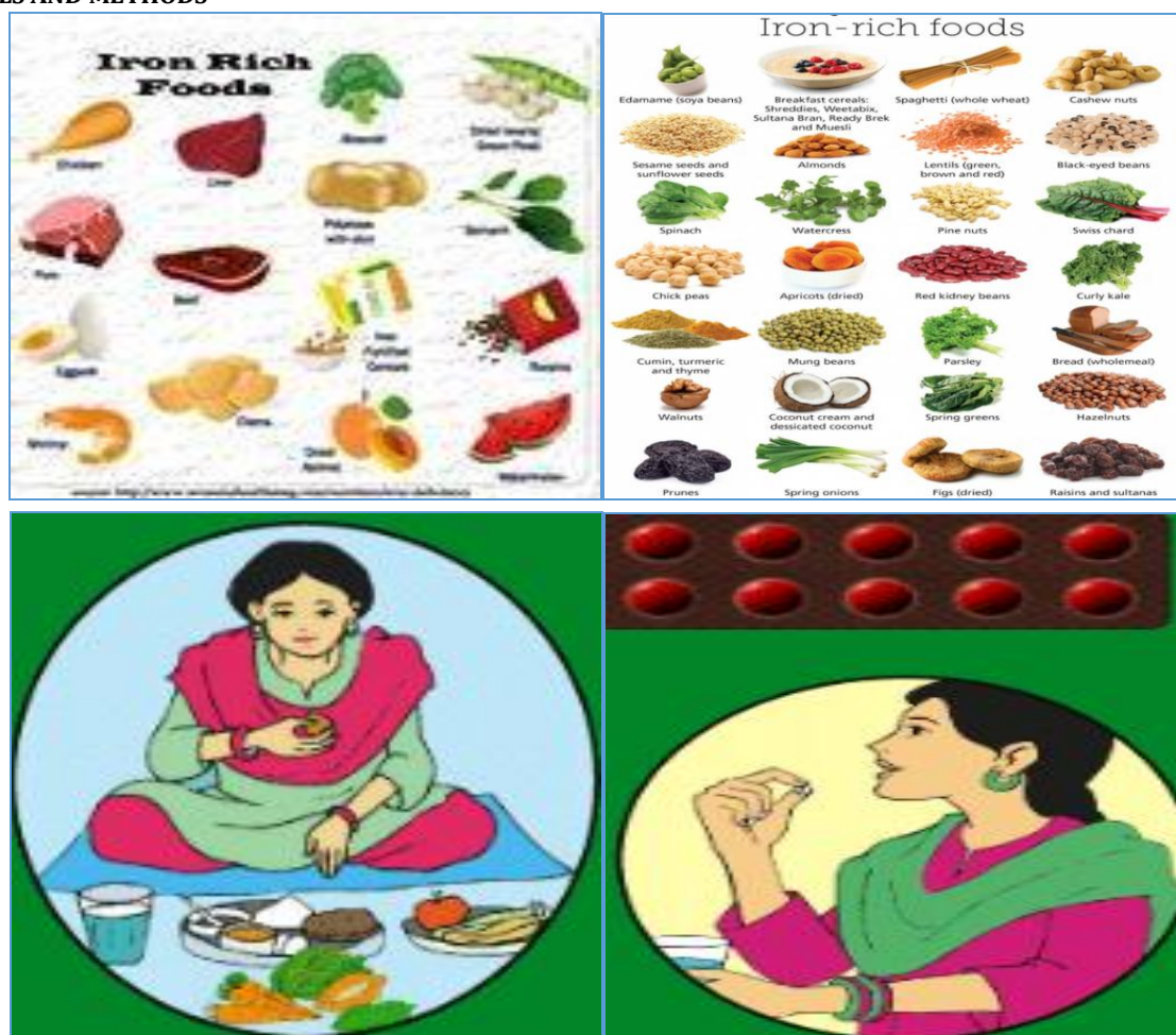
Fig. 1: Quick Look of the Visual Module. All the Images Used in this Module were in the Open Domains

The present study is a community based educational intervention, this quasi-experimental study conducted door to door in girls/women of 15-45 years of age selected from Idgah Slum area (which was selected from total slums of Bhopal by random sampling) and the participants included all girls/women that were present during the visits. Those having severe anaemia were excluded, because they require supervised parenteral therapy and were advised to visit nearby hospital for appropriate treatment. The present interventional study included 336 girls/women of 15-45 years of age, non-probability purposive sampling technique was adopted for study. Participants were explained the purpose of the study and rapport was built up among community members and verbal consent was obtained from them. This study was carried out in phases, the first of which was questionnaire-based assessment, the second institution of audio-visual modules and the third was again a questionnaire-based assessment. An educational intervention was given in the form of audio-visual aid imparted with images, cartoons, videos using you tube and Microsoft Picture Manager were liberally used in order to convey the intended messages.