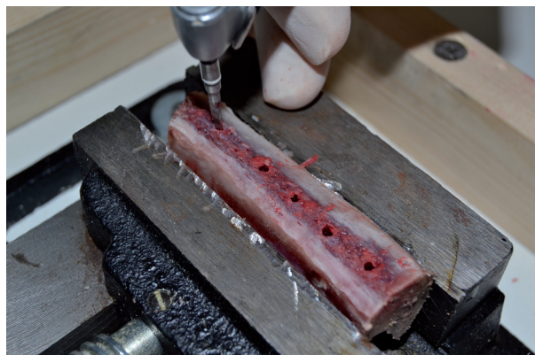
Fig. 1. Surgical procedure: locating implant positions with the cortical drill.

-Study procedure: Bone blocks were fixed in a custom made device and implant site preparation was performed as follows: first, a lanceolate drill was used to mark the positions of the implants and then with a 1.8 mm start-up drill, beds were prepared to one of the two different working depths: 10mm (Group A) and 12mm (Group B). Bed preparation continued following the drilling sequence recommended by the manufacturer, ending with