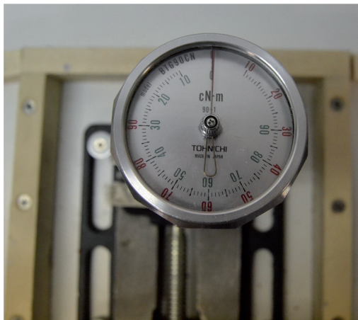
Fig. 2. Implant primary stability measured by peak insertion torque with a manual torque wrench.

The bone blocks were then embedded in plaster and fixed in a custom made rig, designed to avoid the pressure of a clamp that might skew RFA measurement. Four mm diameter and 10 mm length Klockner Essential Cone implants (Soadco, Escaldes-Engordany, Andorra) were inserted in each prepared site with each polished collar in supra-crestal position. Peak insertion torque was measured with a previously calibrated manual torque wrench (model BTG90CN, Tohnichi, Tokyo, Japan) (Fig. 2) and RFA was measured with an Osstell third generation instrument (Osstell, Gothenburg, Sweden) (Fig. 3) perpendicular and parallel to the long axis of the bone blocks (cortical and medullar respectively). Finally, the specimens were scanned again with a CBCT in order to check that the implants