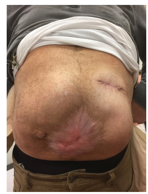
Figure 2. a) Picture of a patient with a left-sided colostomy and complex hernia before SPRLC, b) Picture of the same patient after SPRLC SPRLC: Single-port reversal of left-sided colostomy

in lower postoperative minor and major complications such as SSI, cardiopulmonary complications, anastomotic leakage and need for reoperations. <sup>11</sup> Furthermore, it is important to appreciate the difference in the severity of SSI of the former stoma fenestration, which is relatively small compared with SSI of a laparotomy wound. Moreover, SSI of a laparotomy wound in the presence of prosthetic devices or after component separation can have catastrophic results.