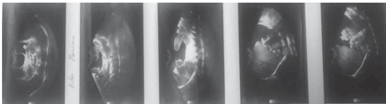
FIGURE 2. Postpartum ultrasound images showing fetal ascites

Hydrops fetalis is excessive fluid accumulation in the subcutaneous tissue in the form of oedema and the body cavities such as ascites, pleural and pericardial effusions. Hydrops fetalis can be mainly catego-