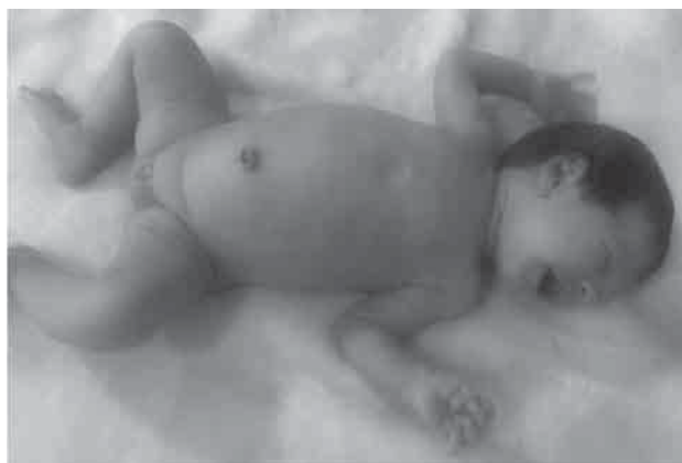
FIGURE 4. The patient on the day of released home from the hospital

On the 25th day of hospitalization, she was released home in a generally stable condition and a normal neurological condition. The baby had monthly check-ups, no complications were observed and psychophysical development was normal (Fig. 4).