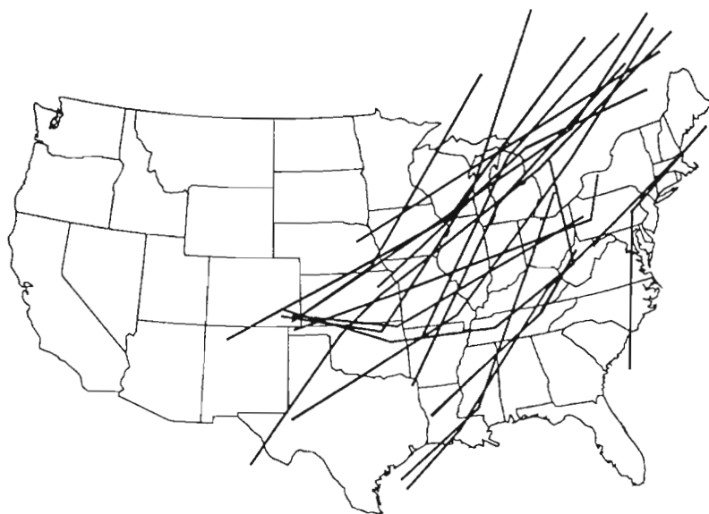
Fig. 3. Storm tracks associated with episodes of high stream-sulfate concentrations, Leading Ridge, Pennsylvania. (Reproduced from Yarnal 1993 with permission of Belhaven Press)

The precipitation distribution for stationary-front events differed from that of the storm events (Table 5). Precipitation values reflect the prolonged, steady rain-