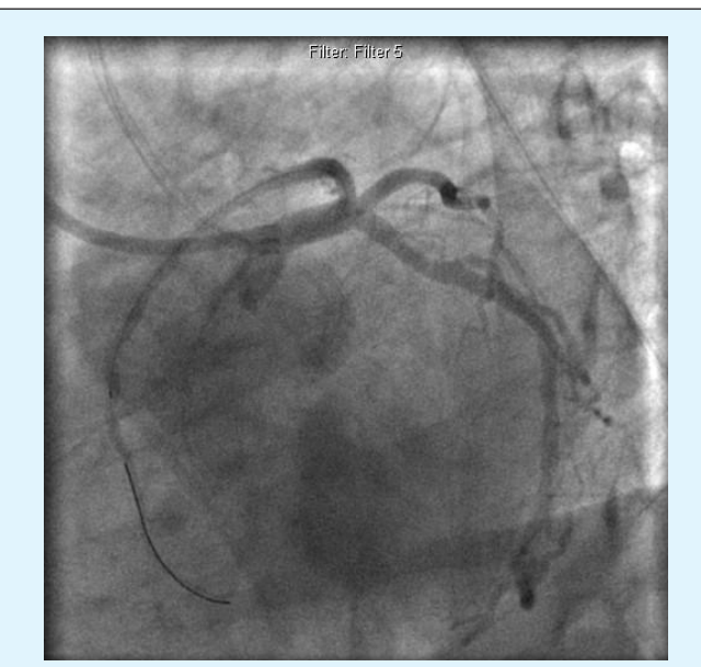
Figure 4: Successful PCI of the complex trifurcation lesions.

As a result of PCI to ramus branch, the ostium of LAD and LCX were comprised, so we did kissing balloons for both LAD and Ramus. The result was good but the ostium of LCX was affected. Then we did kissing balloons between ramus and LCX. The result was good for LCX and ramus but the LAD was compromised again, so we did the kissing balloons at the same time for LAD, ramus and LCx. The final angiographic picture showed a successful revascularization with (TIMI) flow (Figure 4). The patient was asymptomatic and discharged the next day and was advised to continue DAPT with statin.