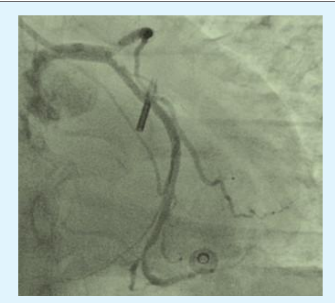
Figure 1: Trifurcation of LM with totally occluded ramus branch.

We decided to do PCI to the culprit lesion which was the ramus branch. A 6 Fr EBU guiding catheter was engaged into the left main via the right radial artery and 0.014-inch coronary wire was placed into the ramus artery. Aspiration catheter was used but it didn't cross the ostium of the ramus branch because of the encroachment of the stent of the LAD. The ostium of ramus showed severe ostial stenosis. As a results of trials of aspiration, the ramus branch appeared as a big and sizable artery. Predilatation was done with balloons 1.5x15 and 2.5x15 the LAD and LCX was compromised, so we inserted 2 wires into the LAD and LCX through femoral artery with another guiding catheter into the left main (Figure 2). We did inflation of LAD, LCX and ramus branch at the same time (Figure 3).