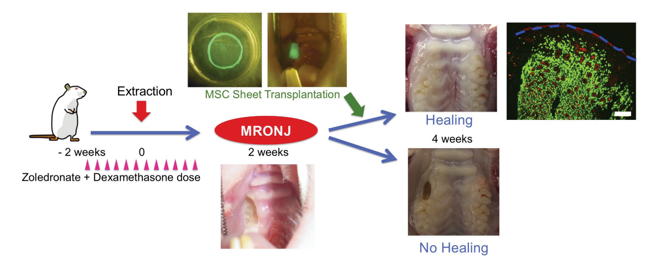
Fig. 2. Multipotent MSC sheets derived from the bone marrow of EGFP-positive SD rats, allogeneically transplanted in rat models with MRONJ-like lesions. MSC sheets were implanted in model rats with simulated medication-related osteonecrosis of the jaw MRONJ-like condition, and their efficacy in the treatment of MRONJ was examined. Normal healing was observed in the transplantation group. In addition, the transplanted EGFP-positive MSCs remained at the transplanted site stimulating the formation of new blood vessels. Scale bar = 200 \mu m.