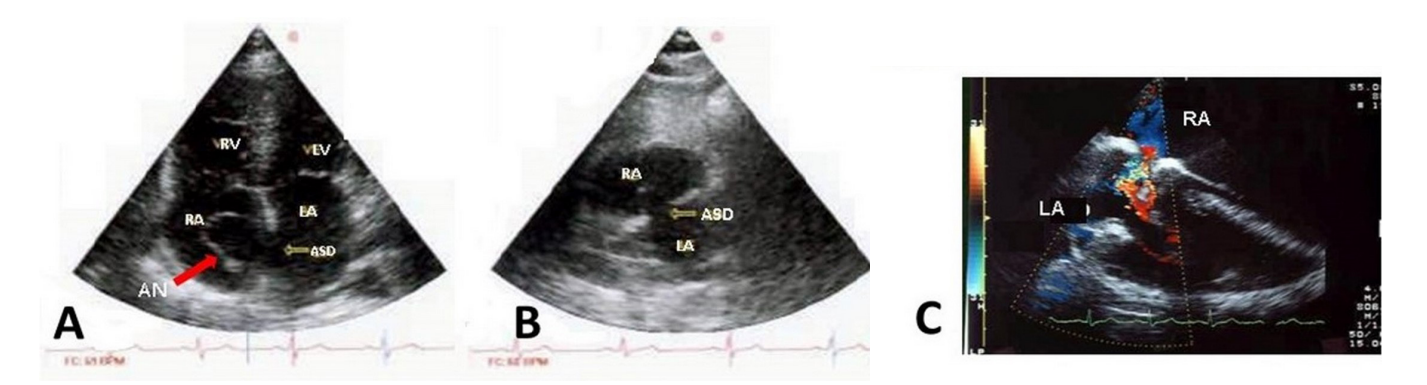
Fig. 1 - Transthoracic echocardiogram. A) The red arrow points to the atrial septal aneurysm; B) the arrow points to the atrial septal defect (ASD); and C) the echo Doppler shows the ASD flow. AN=aneurysm; LA=left atrium; LV=left ventricle; RA=right atrium; RV=right ventricle.