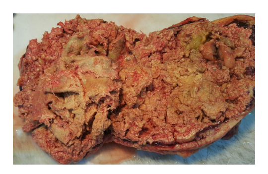
Figure 4. The cavity with textile fiber material inside.