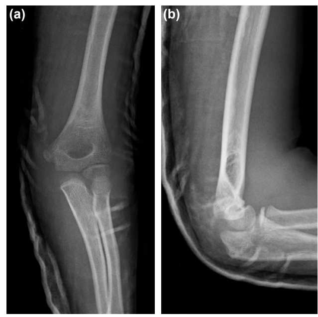
Figure 2. (a) Anteroposterior and (b) lateral radiographs of the left elbow taken after closed reduction.