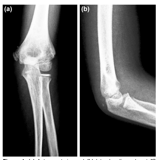
Figure 4. (a) Anteroposterior and (b) lateral radiographs at 6<sup>th</sup> month follow-up after closed reduction.